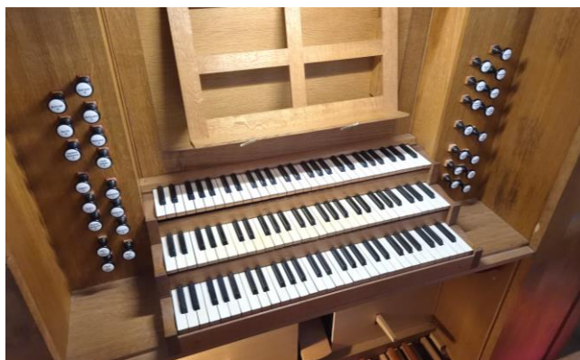
The organ console at St Peter's, Westleton

Once your application has been processed we will send you a Gift Aid Declaration (if applicable) and a GDPR Consent Form, to be completed and returned at your earliest convenience.